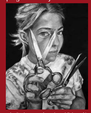
Student work cited as an "American Visions Nominee" for Gold Key winning drawing "Scissors", which is one of five pieces selected as "Best in Show" from across the state.

ARTS : The Masconomet Art Department has gained a national reputation for outstanding achievement through the accomplishments of its students and faculty. We take pride in our solid program, which not only emphasizes the making of art and solving complex visual patterns, but also encourages the ability to discuss art. The art program is open to all students of varying levels of ability and experience. We have a four year sequential program culminating in AP Studio Art in addition to a varied elective program offering over 20 selections exploring new and emerging media. Historically, Masconomet students have been awarded the greatest number of prizes in the Boston Globe Scholastic Art Awards program of any school in the state.